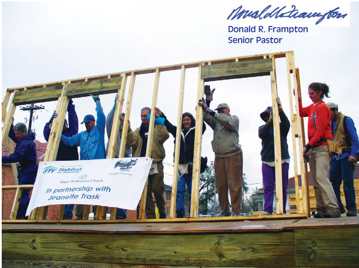
Wall Raising Ceremony for the first NOAHH home sponsored by RHINO, January 2007